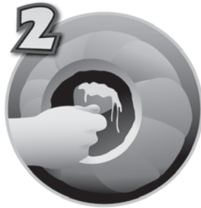
2 Clean and Scrape