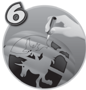
6 Carve Designs