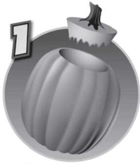
1 Carve out Top