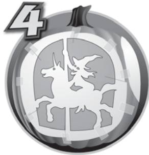
4 Attach Patterns*