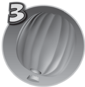
3 Carve out Bottom