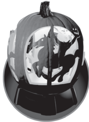
Display in Full!