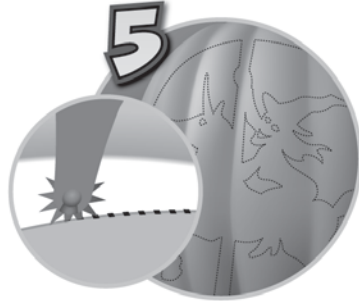
5 Transfer Patterns