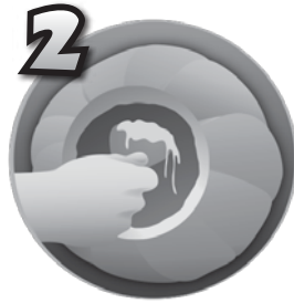
2 Clean & Scrape*