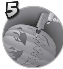
5 Carve Design

Using the screwdriver, poke a hole in your pumpkin. Insert the blade tip, and then press the trigger to turn on. Saw along the design using gentle pressure. Do not force the saw through the pumpkin. Remove and re-insert the blade with the power off to make corners. Release the trigger to power off.