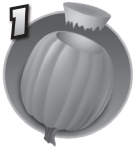
1 Cut out Bottom