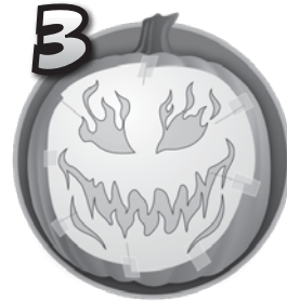
3 Attach Pattern*